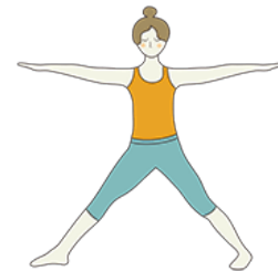
Parsva Hasta Padasana