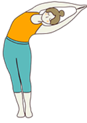
Parsva Urdhva Hastasana