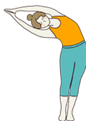
Parsva Urdhva Hastasana