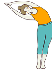
Parsva Urdhva Hastasana