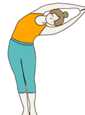
Parsva Urdhva Hastasana