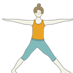
Parsva Hasta Padasana